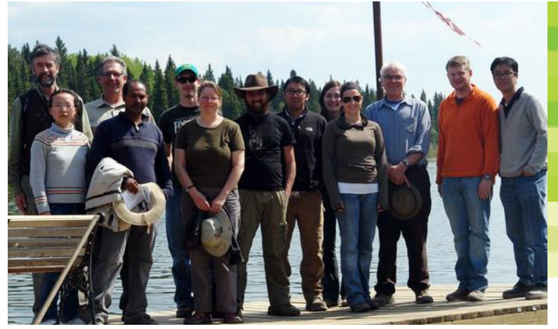
The working group for the Boreal Forest team on a field trip in May 2011.